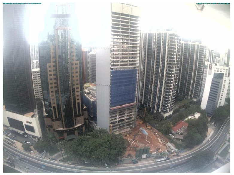
Fig. 2 - Aerial View of the Overall Development

The private development is situated in downtown of Kuala Lumpur. It is a 6-level underground basement car-park with a maximum excavation depth of 37m with layout of 61m x 53m in plan (see Fig.2).